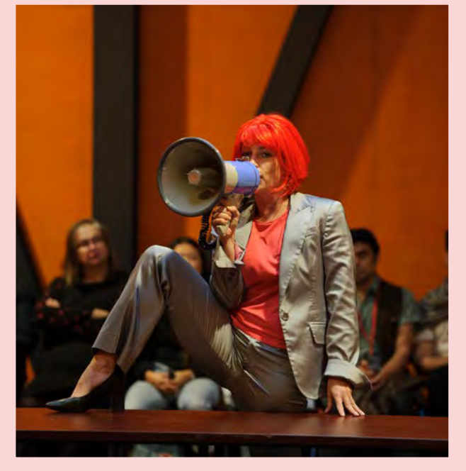
Open Studio, Dance Massive 2019