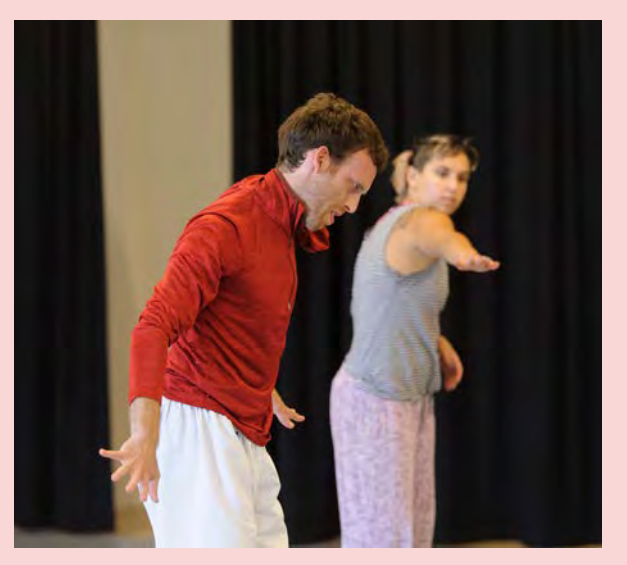
Masterclass by Marrugeku, Dance Massive 2019