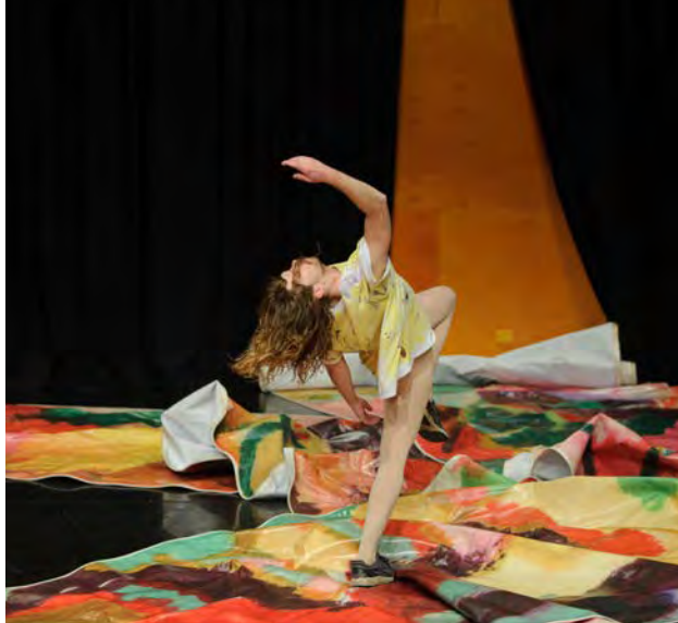
Top image: Masterclass by Marrugeku, Dance Massive 2019 Bottom Image: Open Studio, Dance Massive 2019