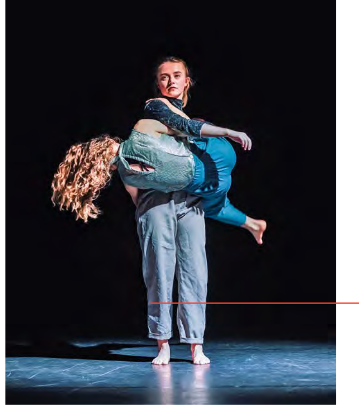
Top image: AYDF 2019 workshop Bottom image: For Those Who Wait, YDance (Scottish Youth Dance) - National Youth Dance Company of Scotland, Scotland, RPM gala performance, AYDF 2019

"It was amazing to hear the differences between the companies based around the world, but key thing is also the similarities; not only in terms of work and themes but also the challenges."