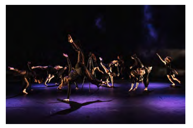
Windthrow, Origins Dance Company, Australia, RPM gala performance, AYDF 2019