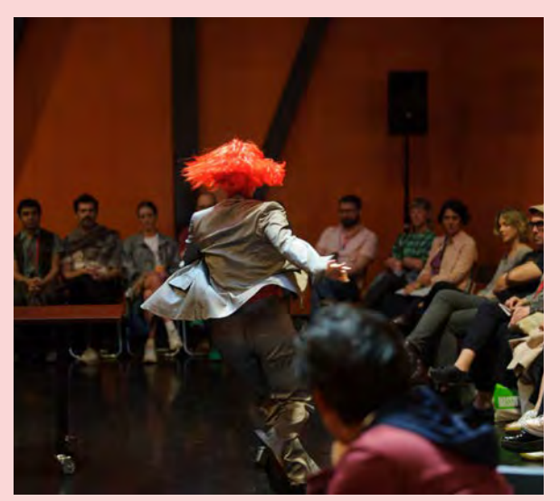
Open Studio, Dance Massive 2019

Ausdance Victoria conducted various consultations with the dance sector to inform the submission