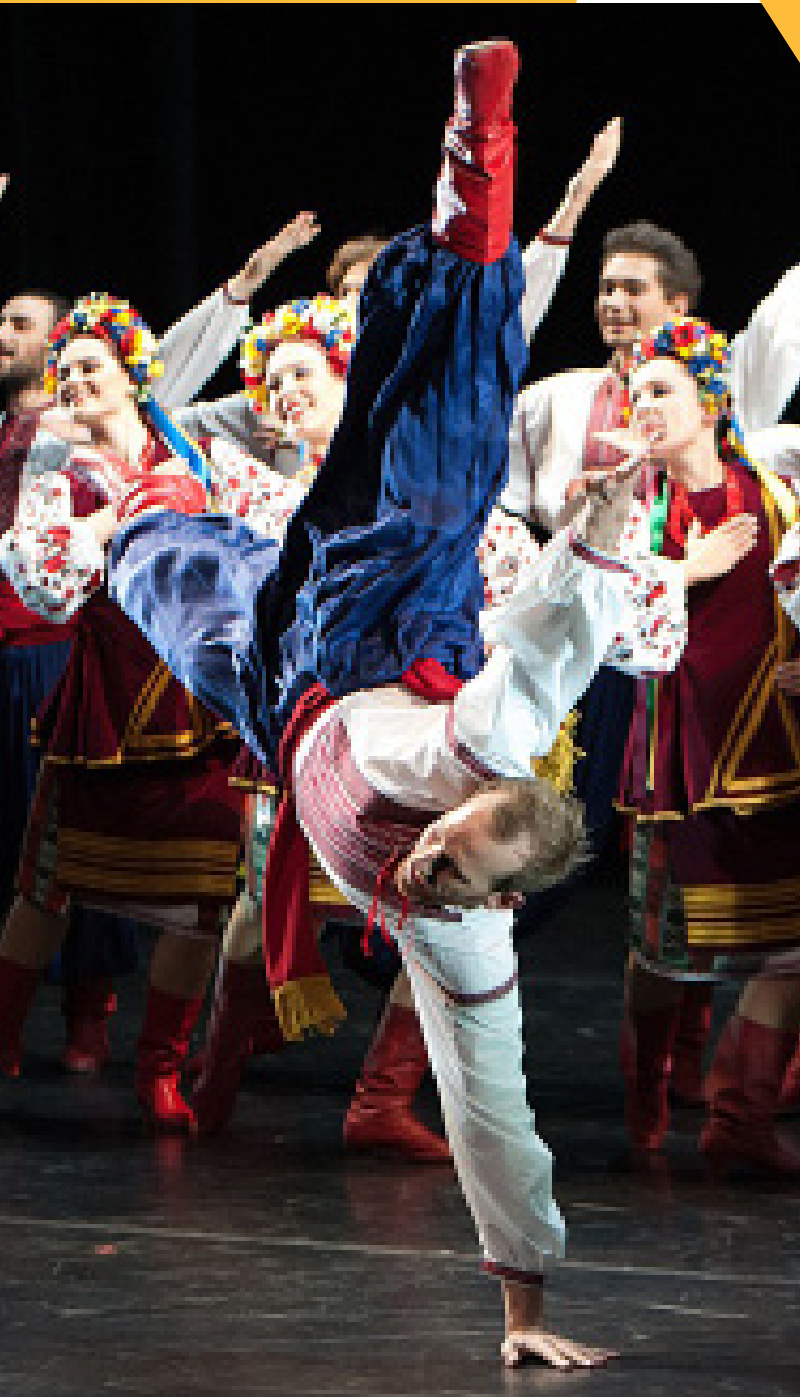
IMAGE OF LEHENDA UKRAINIAN DANCE COMPANY AT 2017 AUSTRALIAN DANCE AWARDS