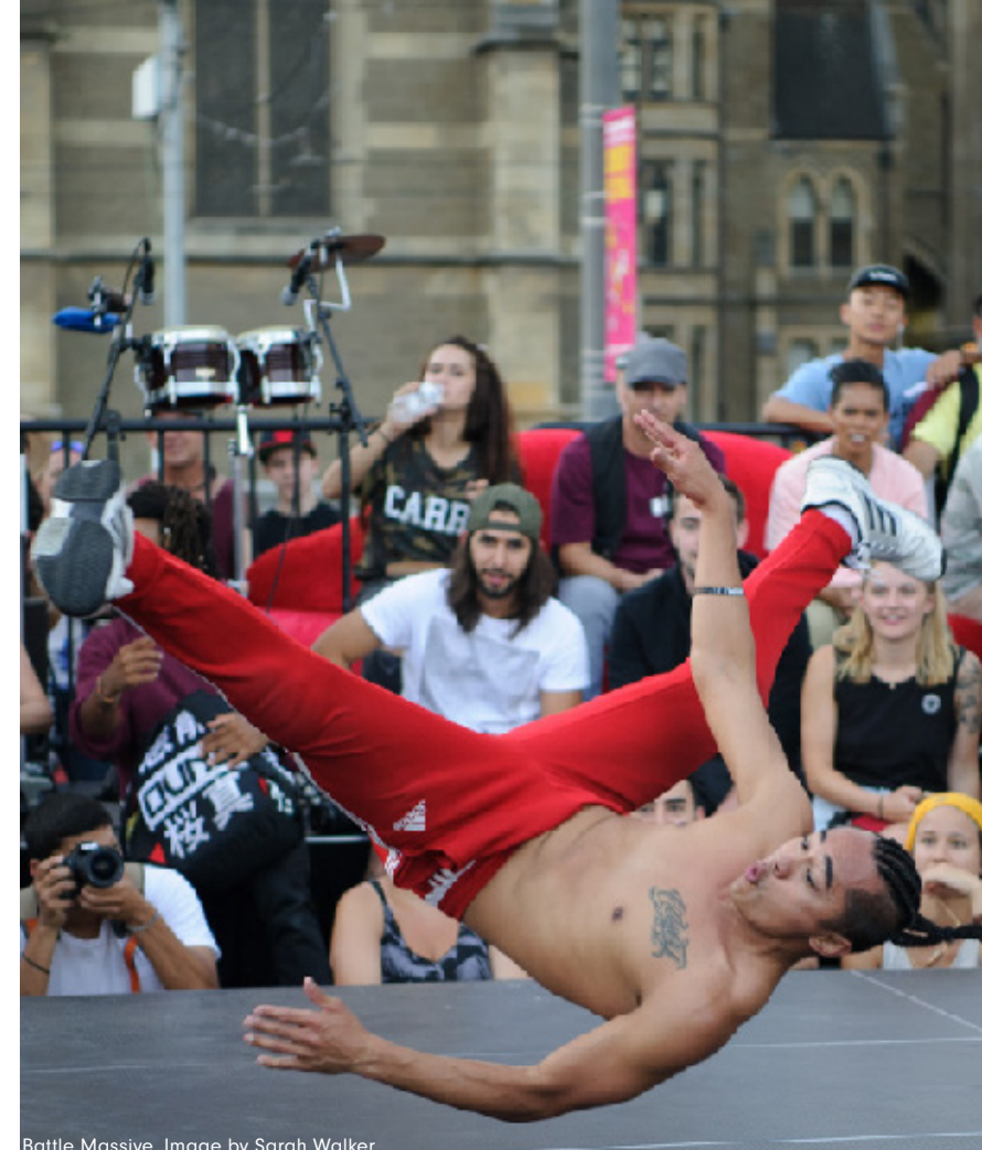
Battle Massive