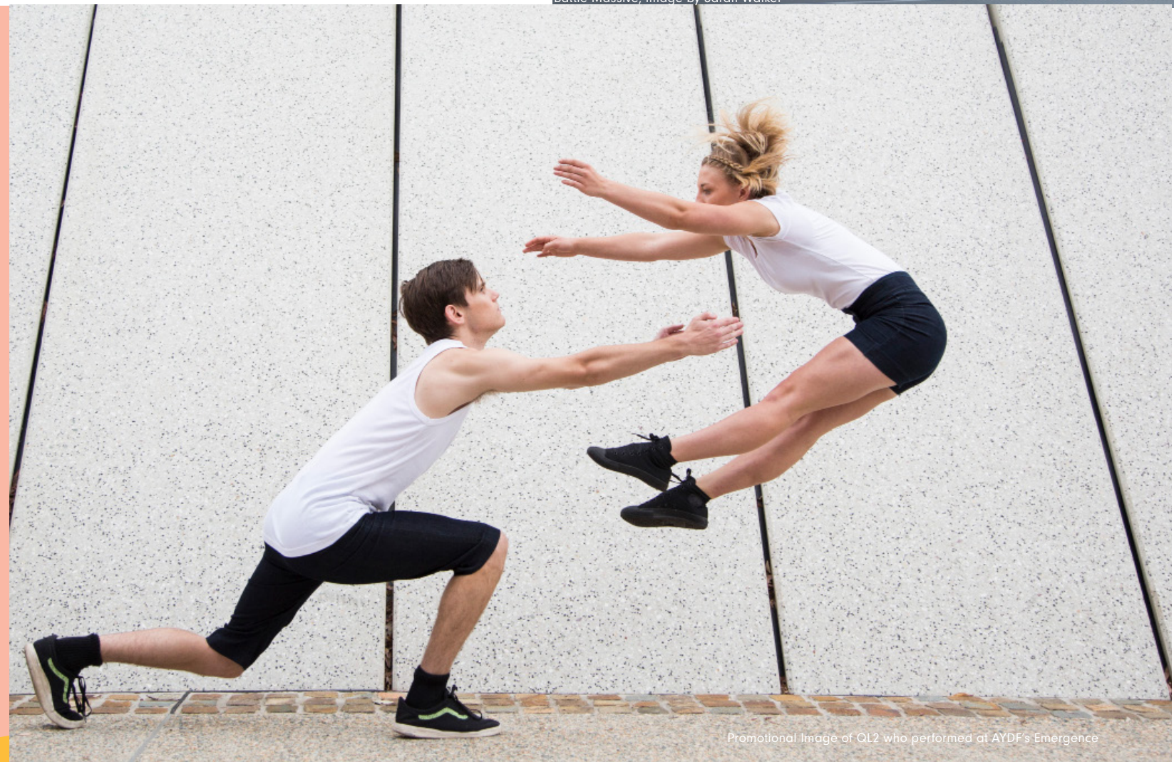
Promotional Image of OL2 who performed at AYDF's Emergence